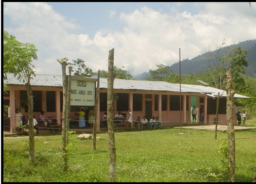
The primary school in San Marcos. The PV installation served as practical experience for our local partner NGO Bayan following the 2004 Honduras EduSol workshop. September 2004