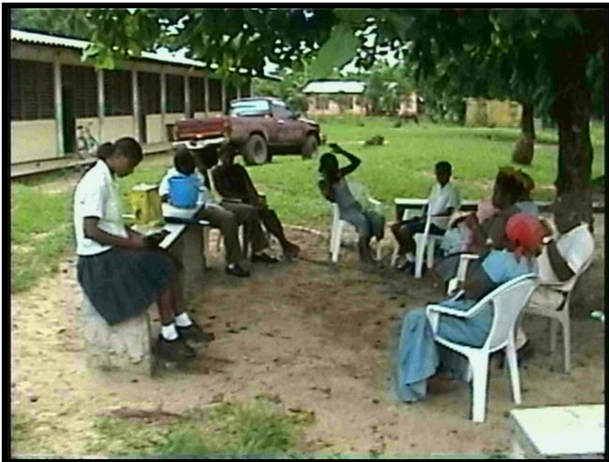
Community project committee meets in school yard