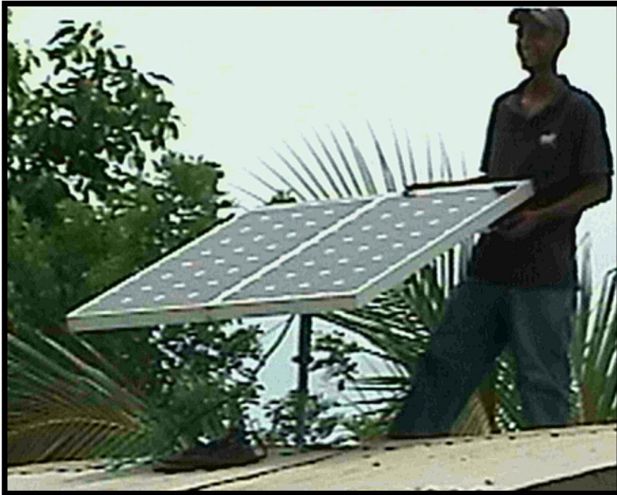
Local PV Technician installs modules on school in Batalla July 1, 2005. Batalla is located in the remote Honduran Moskitia. The project has experienced long delays due to the logistical challenges working in the region presents.