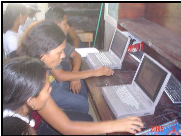
Los Amates youth participate in computer training course. May 2005