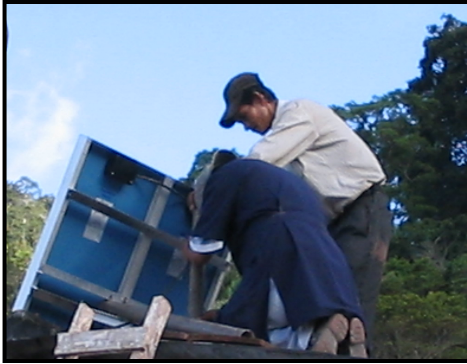
Community member assists Soluz Honduras PV Technician mount the PV array September 2004.