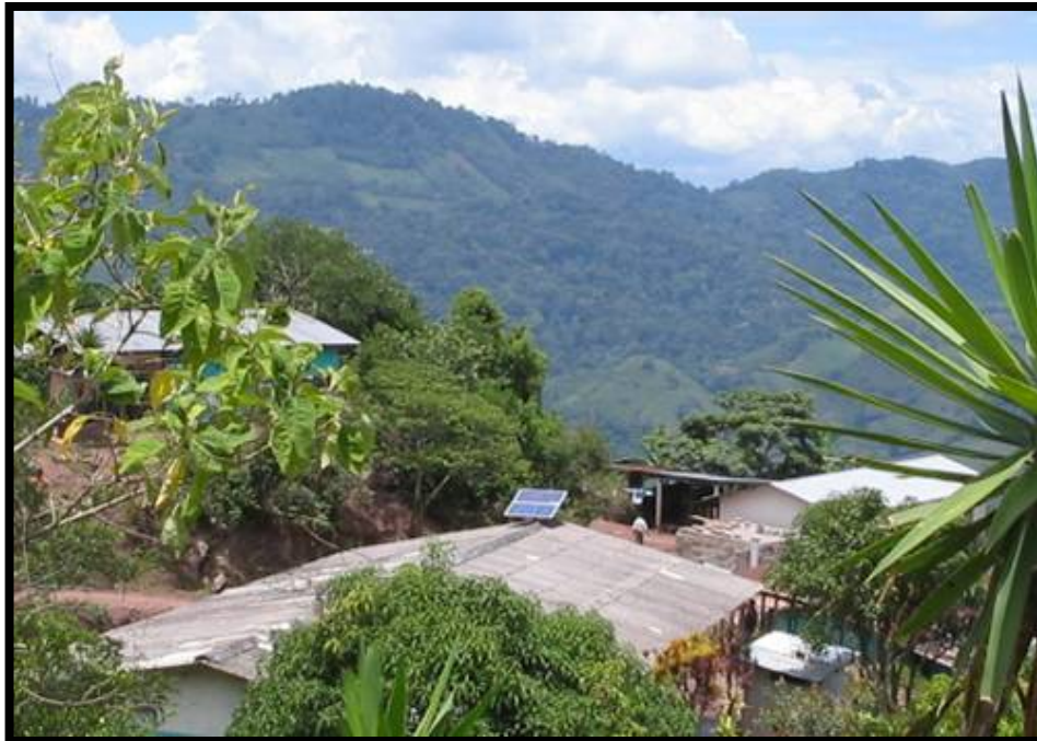
El Ocotillo's primary school. The PV installation served as practical experience for our local partner Christian Children's Fund Honduras following the 2004 Honduras EduSol workshop. September 2004