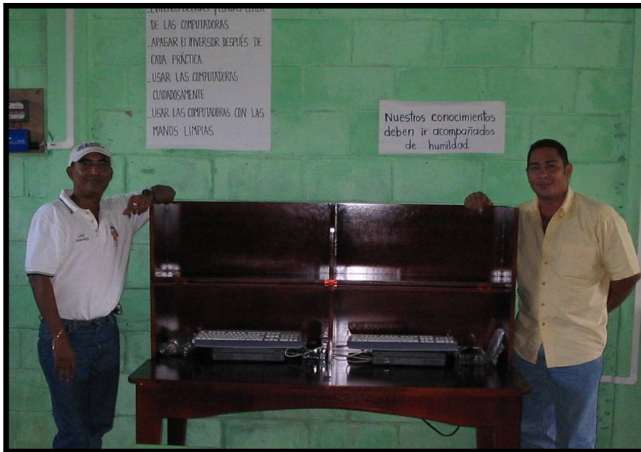
Ministry of Education Project Coordinators, partnering with Bayan and Enersol on the San Marcos project, proudly show off the locally made-to-order EduSol computer desk. April 2005